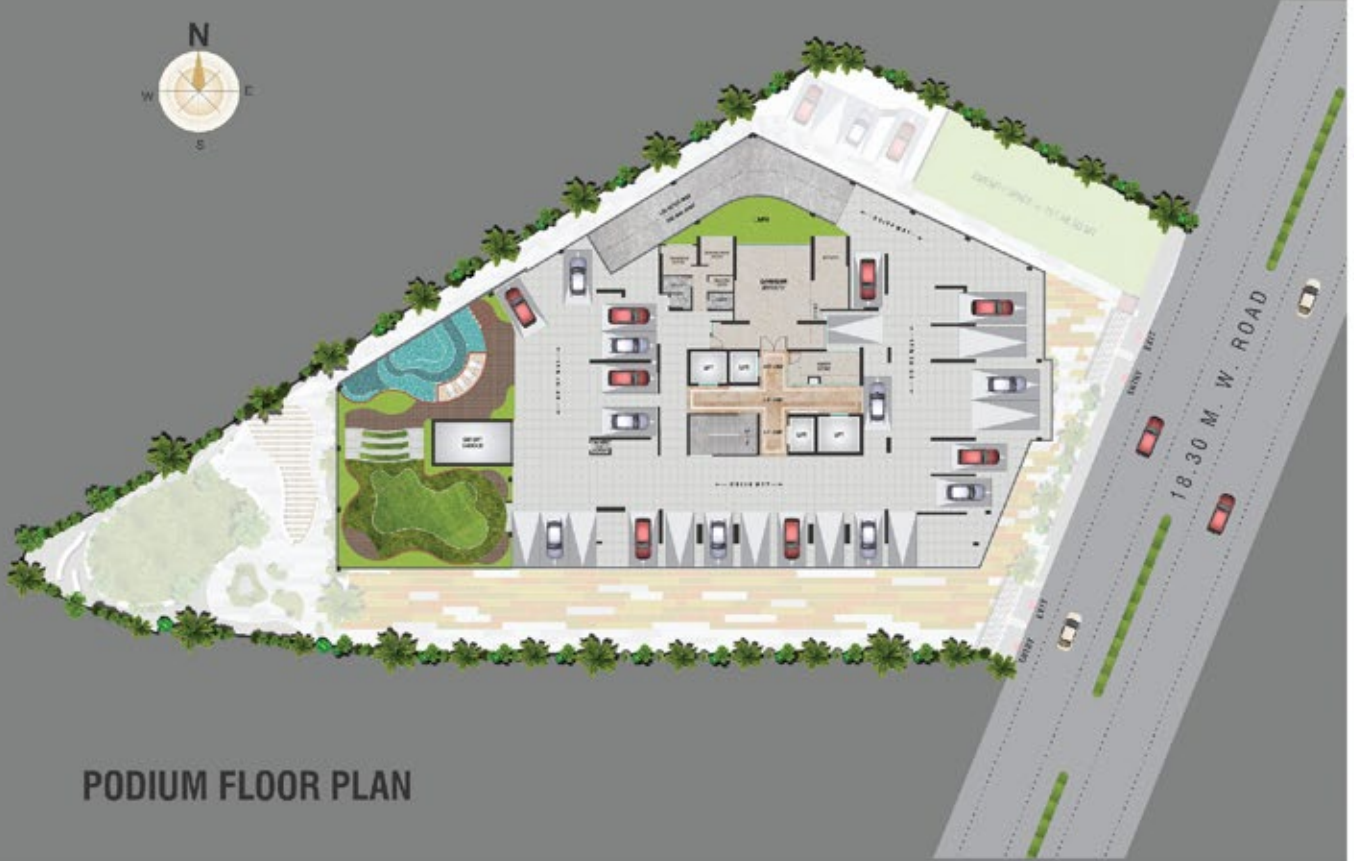
PODIUM FLOOR PLAN

• All render plans and views shown are artist's representation for the simplicity in presentation, certain Plans may show dimensions and areas minutely vary from actual. • Final Finishing as per sales agreement.